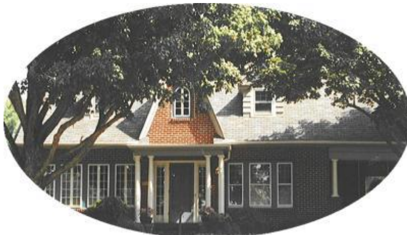
House built with Pine Hall Brick in 1924

There are many old brick structures still standing around the world like the Great Wall of China, the Basilica of Constantine and the ancient structures of the Indus civilization that have stood for thousands of years. Here, in our backyard of North Carolina, we have Pine Hall Brick homes that date back to 1923 (houses were built shortly after our founding in August of 1922) and they are still occupied, providing all the comforts of home.