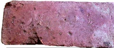
Indus Valley Brick (circa 2-3000 BC)

Brick is “green”, in part, because it lasts a long time. Durability comes from the vitrification of clay particles into a dense mass. Simply, we mix clay shale with water to form a brick, dry it, and then, we fire it to around 2000 degrees. The particles melt or fuse together to create a body structure that resists the ravages of time and weather.