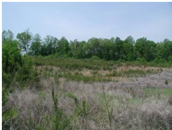
Land reclaimed after mining

Alternative fuels can be both cheaper to use and helpful for the environment. We will use alternative fuels when we can do so cleanly, safely, and within the guidelines of our environmental permits. Several of our kilns are fired on waste wood that otherwise would require disposal. Wood particulate comes from the forestry and furniture industries and may contain trace amounts of binder or finish material. The ability to burn them completely plays a helpful role in waste disposal. Another fuel we use is waste grease from the food service industry that previously had no re-use alternative. Mixed with wood fuel in a patent pending process, the waste grease enhances the BTU content of the fuel while providing a better alternative than dumping it into a landfill.